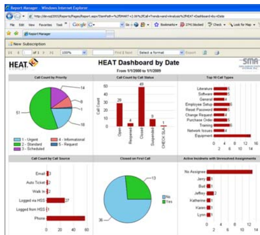
Figure 2. Sample HEAT Dashboards

SMART for HEAT includes a Web console with access to over 40 best practice reports designed by SMA. These parameter-driven reports provide graphs, charts and drill-down functionality that deliver real-time information to enhance IT support processes and drive decisions.